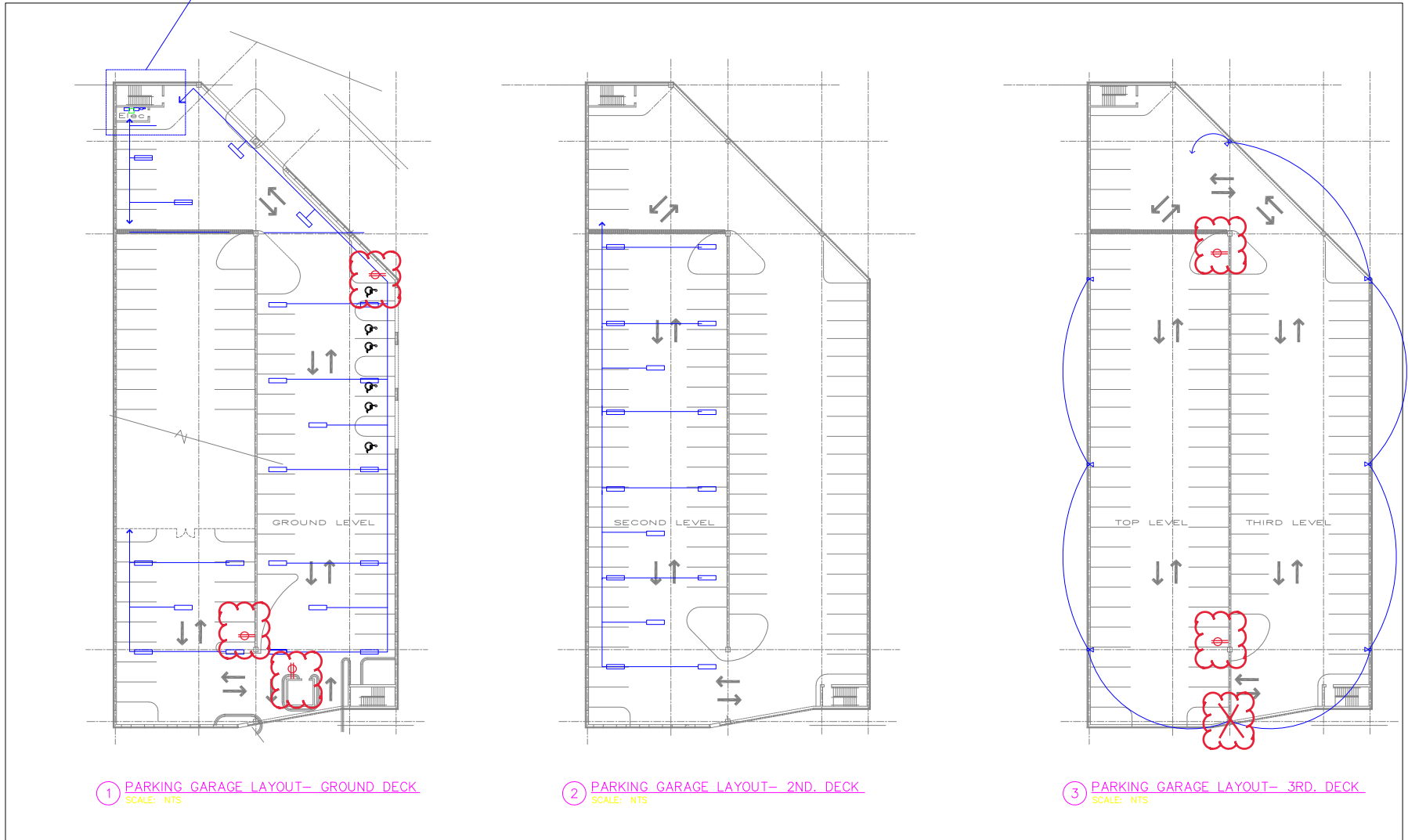
1 PARKING GARAGE LAYOUT- GROUND DECK SCALE: NTS